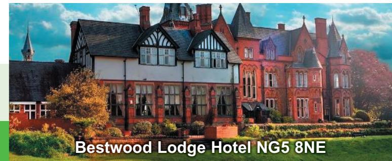
Bestwood Lodge Hotel NG5 8NE

Wednesday 10 November 2021 9:00am – 3:00pm Bookings go live on 13 September 2021