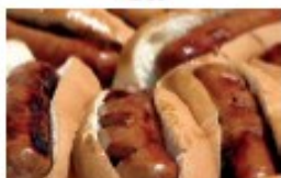
Hot dog &amp; diced potatoes