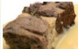
Marble sponge &amp; custard