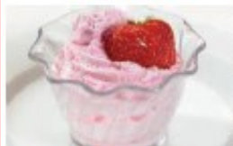
Strawberry mousse &amp; shortbread