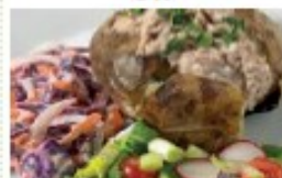
Jacket potatoes with cheese, beans or tuna &amp; mixed salad