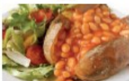
Jacket potatoes with cheese, beans or tuna &amp; mixed salad