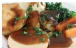
Quorn roast, stuffing, gravy, mashed potato &amp; Yorkshire pudding