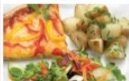
Margherita pizza &amp; new potatoes