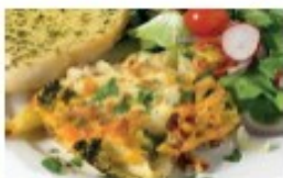
Chicken &amp; broccoli bake, crusty bread