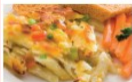
Cheesy pasta bake &amp; garlic bread