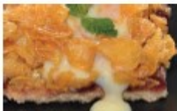
Cornflake tart &amp; custard