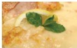
Magic lemon pudding &amp; custard