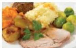
Roast pork, stuffing, gravy, mashed potato &amp; Yorkshire pudding