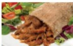
BBQ pulled pork pitta &amp; diced potatoes