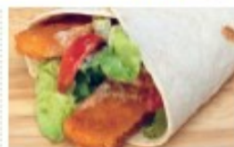
Fish finger wrap &amp; Noisette potatoes