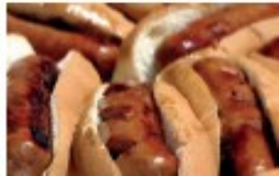
Hot dog & diced potatoes