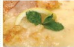
Magic lemon pudding & custard