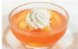
Peaches in jelly & cream swirl