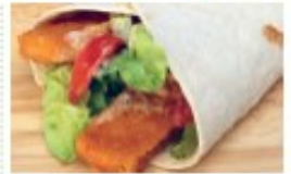
Fish finger wrap & Noisette potatoes