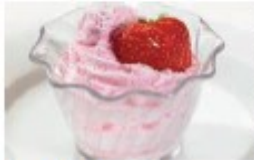
Strawberry mousse & shortbread