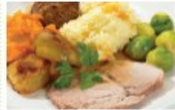
Roast pork, stuffing, gravy, mashed potato & Yorkshire pudding