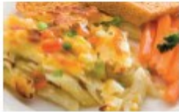
Cheesy pasta bake & garlic bread