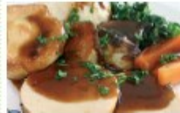
Quorn roast, stuffing, gravy, mashed potato & Yorkshire pudding