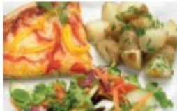
Margherita pizza & new potatoes