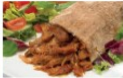
BBQ pulled pork pitta & diced potatoes