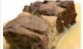
Marble sponge & custard