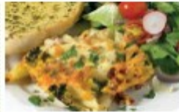
Chicken & broccoli bake, crusty bread