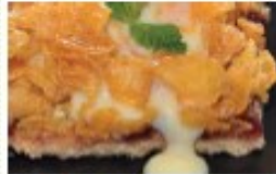
Cornflake tart & custard