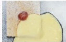
Cherry shortcake & custard