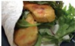
Quorn dippers in a tortilla wrap, jacket wedges