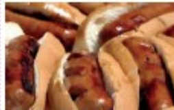
Hot dog in a roll, potato noisette