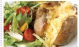
Jacket potato & cheese or baked beans or tuna & mixed salad