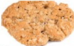
Honey & oatmeal cookie & milkshake