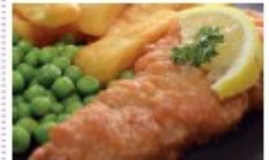
MSC breaded fish, ovenchips