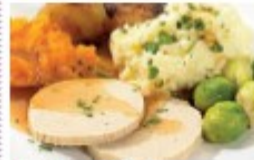
Quorn roast, Yorkshire pudding, roast & mashed potatoes