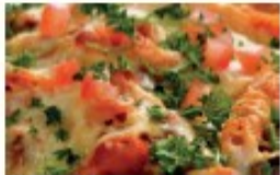
Pasta Neapolitan, garlic slice