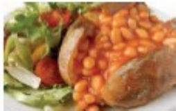
Jacket potato & cheese or baked beans or tuna & mixed salad