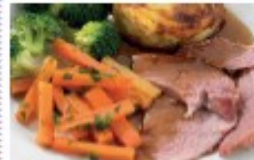
Roast gammon, Yorkshire pudding, gravy, mashed & roast potatoes