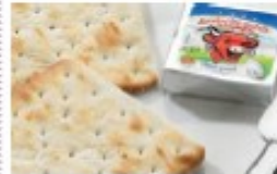
Cheese crackers & apple wedge