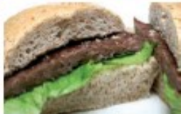
Venison burger in a bun, jacket wedges