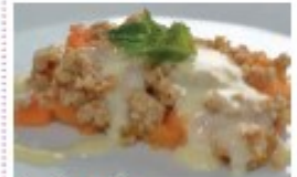
Apricot slice & custard