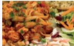
Mediterranean chicken pasta, garlic slice