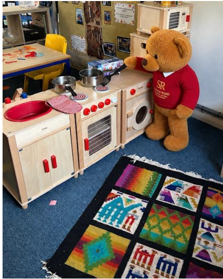
This is our home corner.