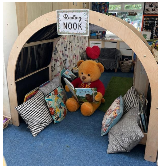
This is our reading nook.