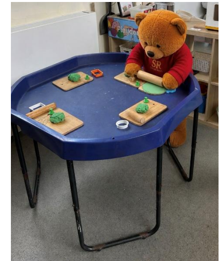
This is our dough area.