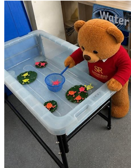
This is our water area.