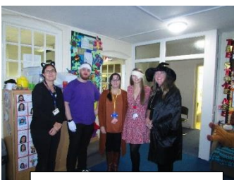
Black Cat Cool Blue Brown Owl Miss Oh No Tricky Witch