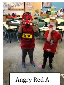
Angry Red A