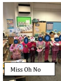
Miss Oh No