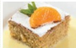
Spiced carrot cake & custard