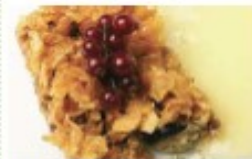
Cornflake tart & custard