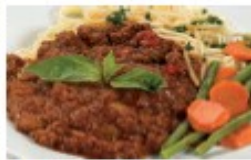
Spaghetti Bolognese, crusty bread