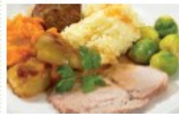
Roast pork, stuffing, gravy, roast & mashed potatoes