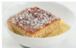
Coconut sponge & custard