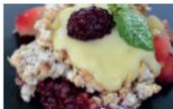
Apple & blackberry crumble & custard