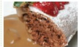
Magic chocolate pudding & chocolate sauce