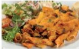
Rigatoni Florentina pasta, garlic slice