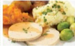
Quorn roast, stuffing, gravy, roast & mashed potatoes