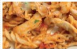
Chicken pasta bake, garlic slice