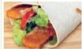
MSC fish finger wrap, noisette potatoes