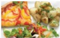
Margherita pizza, jacket wedges