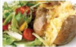
Jacket potato & cheese or baked beans or tuna & mixed salad