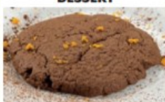
Chocolate & orange cookie & milkshake