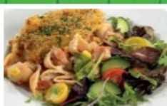
Tuna & sweetcorn pasta & garlic bread