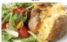
Jacket potatoes with cheese, beans or tuna & mixed salad