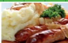
Nottinghamshire sausage, Yorkshire pudding, mashed potatoes & gravy

Soya Milk Egg Gluten Sesame Sulphur Dioxide