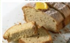
St Clement sponge & custard