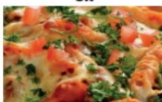
Pasta Neopolitan & garlic bread