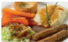
Quorn sausage, Yorkshire pudding, gravy & mashed potatoes