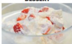
Strawberry Eton mess