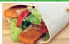
Fish finger wrap & diced potatoes