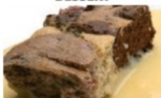
Marble sponge & custard