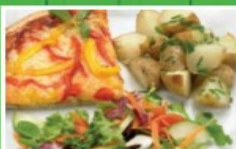
Margherita pizza & new potatoes