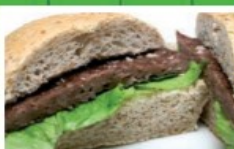
Venison burger in a wholemeal bun & carrot fries

Soya Milk Egg Gluten Sesame Sulphur Dioxide