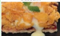
Cornflake tart & custard