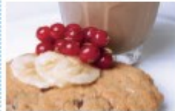
Fruit cookie & hot chocolate