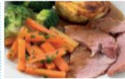
Roast gammon, Yorkshire pudding, gravy, mashed & roast potatoes