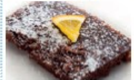
Pear & chocolate sponge & chocolate sauce