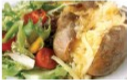
Jacket potatoes with cheese, beans or tuna & mixed salad