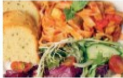
Mediterranean tagliatelle & garlic slice