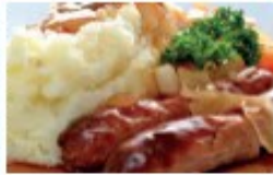
Nottinghamshire sausage, Yorkshire pudding, gravy & mashed potatoes