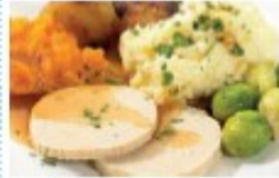
Roast Quorn, Yorkshire pudding & gravy with mashed & roast potatoes