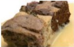
Marble sponge & custard