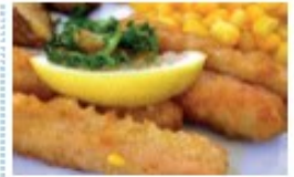
Fish goujons & potato wedges