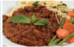
Spaghetti bolognese & garlic slice