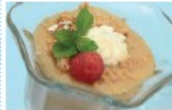
Butterscotch mousse & shortbread finger