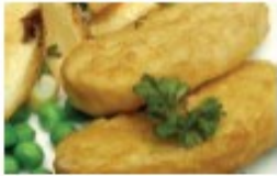
Quorn dippers & savoury rice