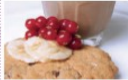
Honey & oatmeal cookie with milkshake