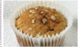
Apple & cinnamon muffin