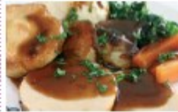
Quorn roast, stuffing & gravy with mashed & roast potatoes