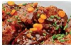
Porkies in gravy, Yorkshire pudding & mashed potatoes