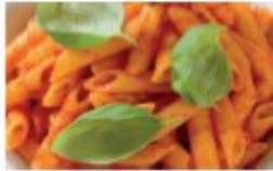
Tomato & basil pasta with garlic slice