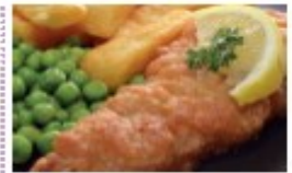
MSC Breaded fish & chips