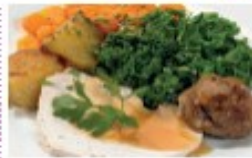
Roast turkey, stuffing & gravy with mashed & roast potatoes