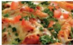
Pasta Neapolitan & garlic slice