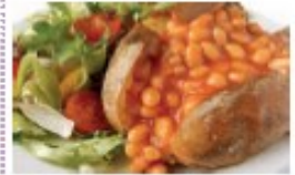
Jacket potatoes with cheese, beans or tuna & mixed salad