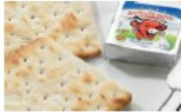
Cheese, crackers & apple wedge