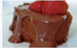
Chocolate ice cream roll & chocolate sauce